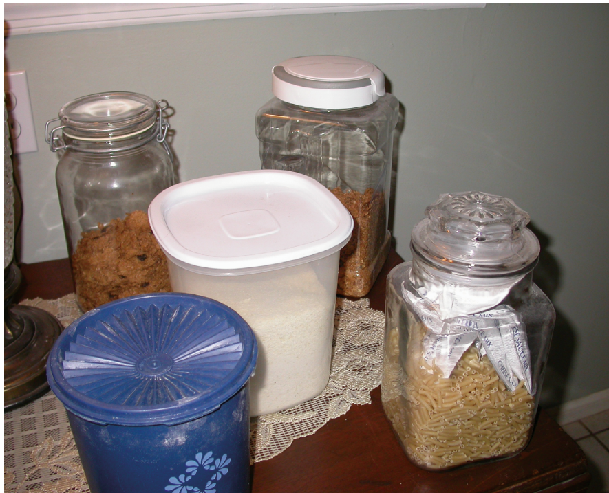
Figure 11. To prevent future infestations or the spread of a current infestation, it is advisable to store open packages of food in containers with tight-sealing lids.

Numerous species of small beetles and moths, referred to as stored product pests, commonly infest food and non-food items in the home. The most common stored product pest found in homes is the Indianmeal moth. Often, the first indication of a stored product pest infestation is the discovery of infested food items or the sudden, and then persistent, presence of small insects in a particular area of the home. If unaddressed, infestations of stored product pests can spread rapidly into other parts of the home, making control very difficult. Because some pests of stored products are long-lived, highly mobile, attracted to the odor(s) of susceptible food sources, and capable of chewing through packaging, when an infestation is suspected it is important to inspect all items susceptible to infestation so that the source of the infestation can be removed. Ultimately, the key to resolving an infestation of a stored product pest is to find the infested item(s) and either dis-infest or discard it. Unless the infested item(s) are found, the infestation is likely to