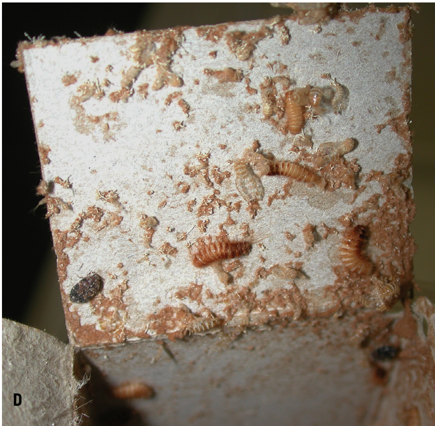
Figure 7. (C) Trogoderma larvae are capable of chewing through cardboard boxes to get to food sources inside. (D) Severe infestations of warehouse beetles are often characterized by an abundance of cast larval skins, live larvae of various sizes, and adults found infesting the same item.

storage closet), then look elsewhere. Items not considered human food may support a population of a stored product pest. Bird seed and dry pet food are common sources of stored product pest infestations (Figure 9). Other sources may include wall and table decorations, ornaments, pot pourri , and jewelry that contains items of plant or animal origin (Figure 10). When an infested item is found and the decision to discard it is made, the item should be tightly sealed within a bag and immediately placed in an outdoor trash receptacle for removal.