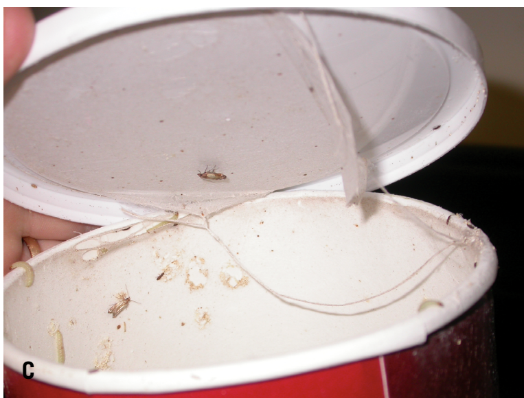
Figure 1. (A) The Indianmeal moth (approximately 1/2 inch long) is the most common stored product pest found in homes, where it commonly infests cereal and other grain-based foods. (B) Indianmeal moth larvae (approximately 5/8 inch long and dirty-white to pink to greenish colored) often crawl away from feeding sites before they pupate. (C) A telltale sign of Indianmeal moth infestation is the presence of silk webbing produced by larvae.