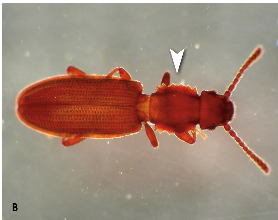
Figure 2. (A) Sawtoothed grain beetles are very small (approximately 1/16 to 1/8 inch long) insects that infest many of the same foods as Indianmeal moths. Shown here (circled) are adult sawtoothed grain beetles infesting oatmeal. (B) Sawtoothed grain beetles get their name from the saw-like row of pointed teeth on either side of the body, just behind the head.