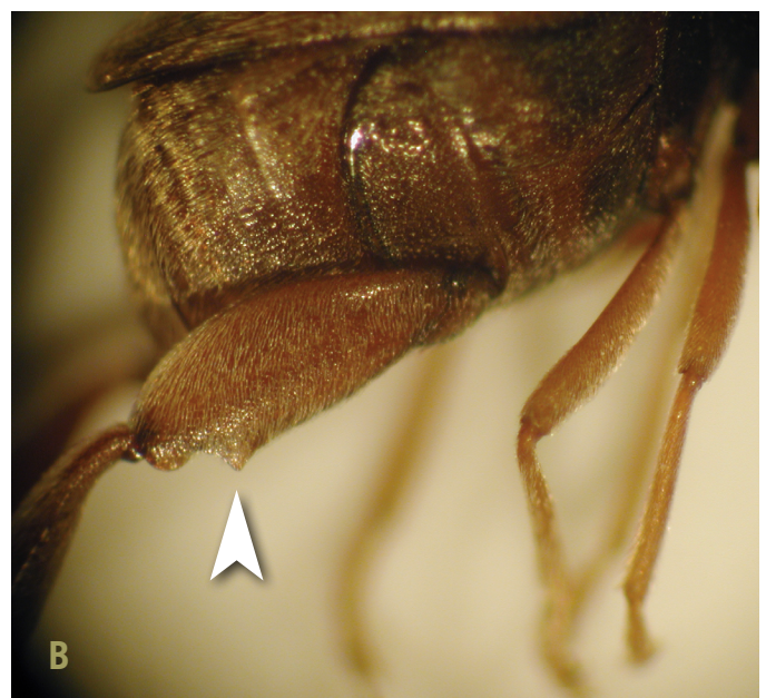
Figure 5. (A) Adult cowpea weevils have long legs, long antennae, and abbreviated wing covers that do not completely cover the abdomen. (B) Adults also have an enlarged femur on the hind leg that bears a single, large tooth.