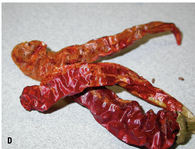
Figure 8. (A) Drugstore beetles are approximately 1/8 inch long, light brown to tan, and covered with small, golden hairs. Wing covers are characterized by longitudinal rows of pits or indentations. (B) Adult drugstore beetle antennae end in three expanded segments. Drugstore beetles consume almost anything of plant or animal origin, including, for example, (C) dog treats and (D) dried peppers. Note round exit holes made by adult beetles as they emerged from the infested item.