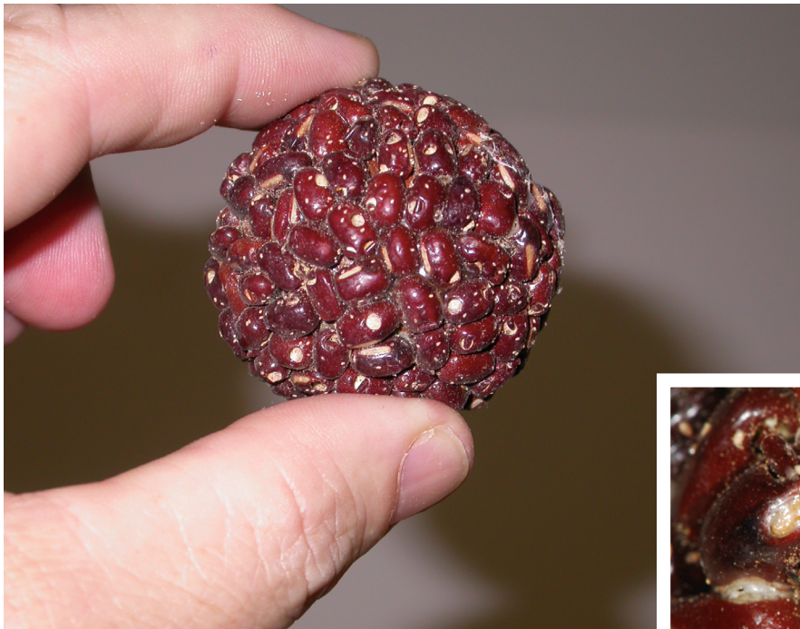
Figure 10. When looking for the source of a stored product pest infestation, inspect all items containing materials of animal or plant origin, including decorative items such as this ornament made from beans. Inset: Closeup of holes in beans from which cowpea weevils emerged.

Several types of attractants are used in traps. Pheromones are highly volatile chemicals produced by insects to communicate specific behaviors to