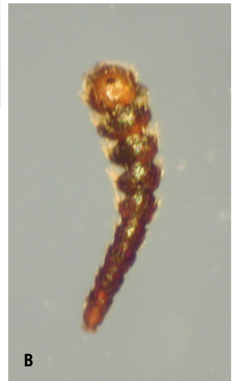
Figure 3. (A) Flour beetles (shown here in wheat flour) are approximately 1/8 to 3/16 inch long and dark cherry to dark brown in color. (B) Adult flour beetles have gradually-clubbed antennae.

faint spots can be highlighted by slight moistening of the wing covers. Notably, the weevil's body is covered with small, round pits or indentations. As is common in weevils, they also have a long snout (Figure 4). The larvae generally require a food source with a hard or semi-hard coating in which to develop properly (e.g., corn kernels, rye, barley, cereals, wheat, dried peas, beans, nuts, bird seed, or rice). Adult female weevils lay eggs in whole kernel grains, such as corn, by first chewing a small depression in the kernel, depositing an egg in the depression, and then sealing the egg inside with a gelatinous plug that they produce. When the larva hatches from the egg, it starts consuming the inside of the kernel. The larva continues to feed and grow inside the kernel. All larval stages of the beetle are spent inside the kernel, obscured from the naked eye. The last larval instar pupates, and the adult weevil emerges from the kernel several days later, leaving a small, round hole in the kernel.