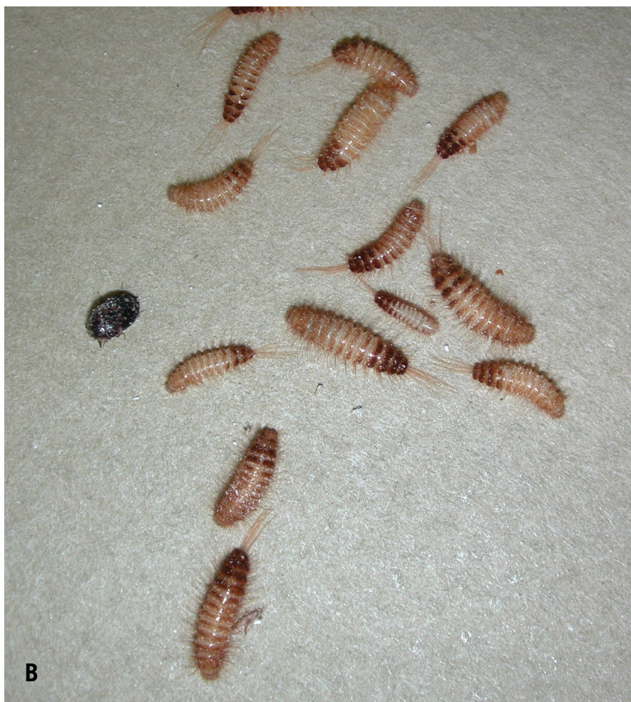
Figure 7. (A) Trogoderma beetles, such as the warehouse beetle, are oval shaped, 1/8 to 3/16 inch long and mottled in color. The wings are covered with fine hairs. (B) Trogoderma larvae are covered with tufts of long hairs. Additionally, the hairs on the last several abdominal segments are dark red to cinnamon colored.