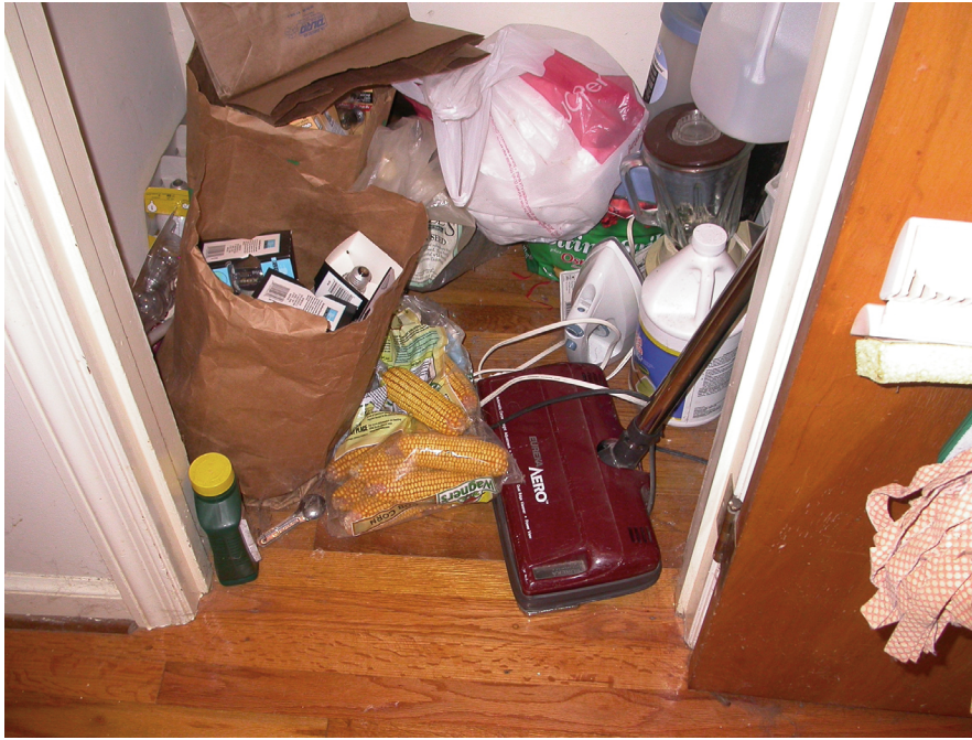
Figure 9. Because of their mobility, infestations of stored product pests can spread into areas well away from their original point of origin (often the kitchen, cupboard, or food storage closet). When seeking out the source of a stored product pest, if the infestation cannot be found in the kitchen, look elsewhere. In this photograph, stored product pests were found infesting corn (bird and squirrel food) that had been stored in a utility closet and forgotten.

sources (by odor), and capable of chewing through sealed packaging or entering small openings and opened packages to reach the food inside, it is important to commit to these preventive practices early and for the long term.