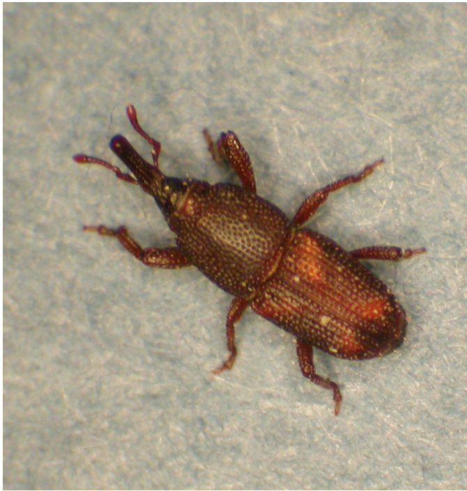
Figure 4. Adult rice weevils (approximately 1/8 inch long) are easily recognized by their long snout and by the four pale spots on their wing covers. Rice weevils typically infest whole kernel foods, such as corn or “Indian corn.”

wing covers of the weevil have a large, rounded spot at mid-length. They do not completely cover the abdomen, leaving part of it exposed (Figure 5). Like rice weevils, cowpea weevil adults sometimes play dead when disturbed.